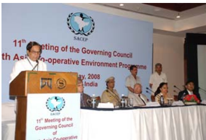
Hon' Namo Narian Meena, Minister of State for Environment & Forests, Government of India