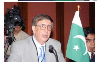
5. H.E. Namo Narian Meena, Minister of State for Environment & Forests, Government of India was elected as Chairman of the 11th Governing Council of SACEP.