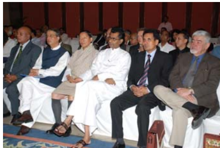
Hon. Ministers of the Meeting