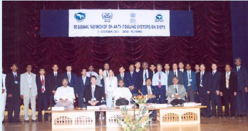
Participants of the workshop

A regional workshop addressing issues pertaining to the implementation of the International Convention on the Control of Harmful Antifouling System on ships, (AFS Convention) was held in Chennai, India from the 3 rd to the 6 th October 2005. The workshop was attended by 32 participants representing fourteen Asian countries, including Bangladesh, Cambodia, China, Democratic Peoples Republic of Korea, Indonesia, Iran, Malaysia, Myanmar, Pakistan, Philippines, Singapore, Sri Lanka, Thailand and Vietnam.