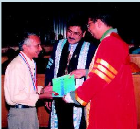
Director General, SACEP presenting awards at the SUNFO Award Ceremony