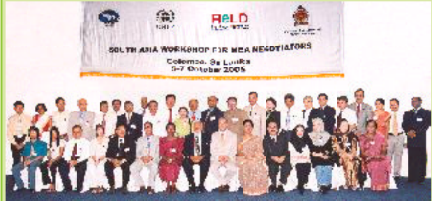
Participants with the chief guest and other invitees to the inauguration of the Workshop

The objective of workshop was to strengthen and enhance the skills of the participants to better participate and effectively negotiate MEAs.