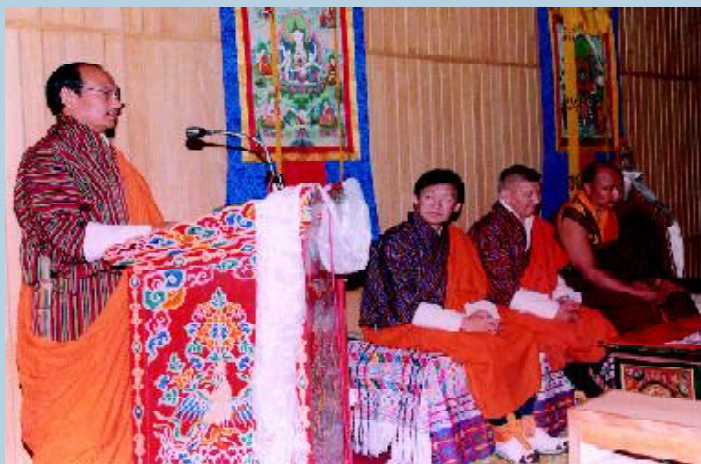
H.E. Lyonpo Yeshey Zimba, Prime Minister of Royal Government of Bhutan addressing the Meeting