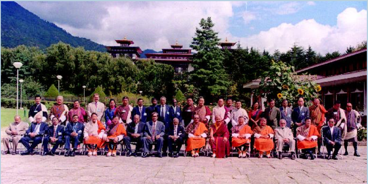
Delegates with the Hon. Prime Minister of Royal Government of Bhutan