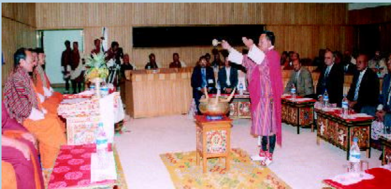
A Traditional Marchang Ceremony Conducted at the Inauguration of the G.C