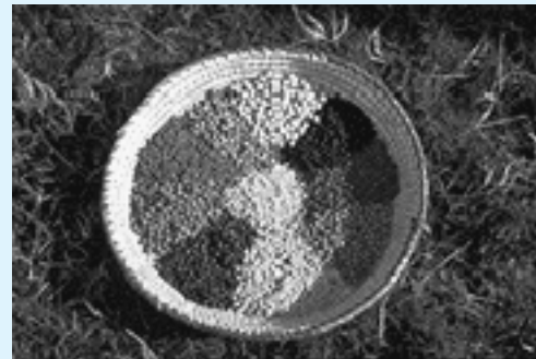
Chickpea germplasm. Bt chickpea is one of four crops on which Bangladesh is reported to be conducting biotechnological research

It would also monitor the importation and introduction of GMOs and the research and processes of biotechnology and GE to protect the environment and citizens from biological pollution, hazards and dangers of such technologies.