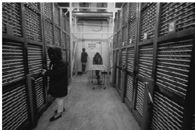
IRRI's genebank in Los Banos, Philippines. This facility contains the most comprehensive collection of rice genetic resources on earth.

The rice was field tested on a group of 27 nuns, chosen because of their disciplined lifestyles and moderate diets. Preliminary tests showed that the serum ferritin levels in the blood had increased, in some as much as two to three times.