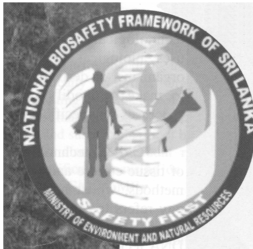
The logo of the NBF Project in Sri Lanka. The focus of the NBF formulation is on safety in the use of GMOs.

Sri Lanka is in the process of establishing a national biosafety framework (NBF) (by National Biosafety Framework Development Project under the Ministry of Environment and Natural Resources) that includes guidelines for laboratory-based experiments, for testing in the green house and for small and large scale field trials of genetically modified organisms (GMOs) and GM plants and for their commercialization and release into the environment or food chain, and for transboundary movement of GMOs in line with the Cartagena Protocol (ratified by Sri Lanka in 2004).