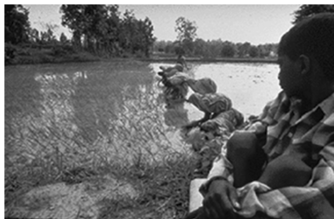
Growing rice in paddy lowlands. Rice forms the staple food of most of the South Asian countries, but rapid population increase coupled with depleting resources is threatening this food resource. Countries are now looking at biotechnology as a possible solution, but its capacity to solve food shortage is under intense debate.

In a presentation by the Biosafety Capacity Building Cell of the Ministry of Environment (MoE) in April 2004, an MoE