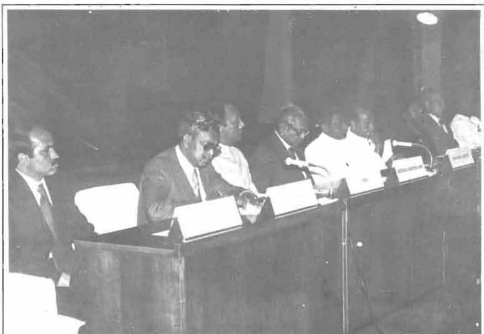
Ministerial Meeting to initiate the South Asia Co-operative Environment Programme, held in Colombo, Sri Lanka, February 1981.