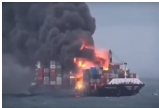
MV Express-Pearl Fire to help keep fires going

Sri Lanka authorities has sought Indian Coast Guard assistance towards fire fighting and for augmenting pollution response measures in the light of Oil Spill. Upon government directives, ICGS Vaibhav, an offshore patrol vessel with external foam fire fighting and pollution response capabilities on maritime patrol, was diverted for assistance and arrived on scene of incident PM today. Another ICG offshore patrol vessel Vajra with similar capabilities for fire fighting and pollution response has also been deployed ex- Tuticorin.