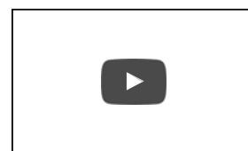
2017 GREEN4SEA Awards - Highlights