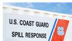
Tug causes oil spill after sinking at pier in Alaska