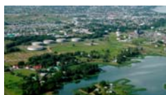
Investigation team established for bunker spill off Trinidad and Tobago