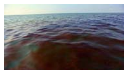
USCG sets safety zone after dielectric fluid spill